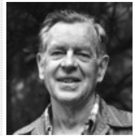
What about this guy's role!

"A hero ventures forth from the world of common day into a region of supernatural wonder: fabulous forces are there encountered and a decisive victory is won: the hero comes back from this mysterious adventure with the power to bestow boons on his fellow man."