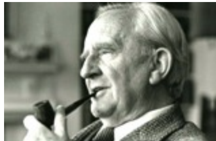
Did Tolkien write Star Wars?